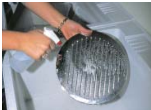
4) Tisa Weisz gets to work on the air cleaner top to get it clean.