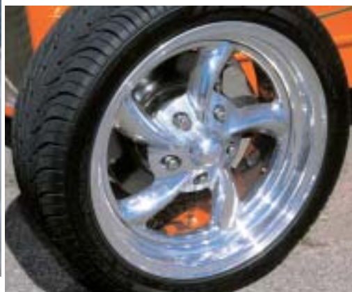
15) How would you like to be able to stop polishing your billet wheels? These haven't been touched in a year.