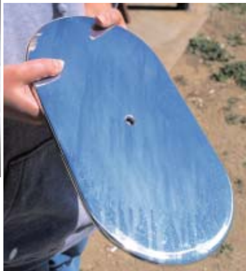
14) We left this piece in the sun with water on it until all the water was evaporated. The leftover haze was easily wiped off and the part looked perfectly polished again.