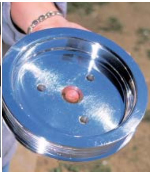
13) We left the Gunk Engine Brite on the pulley for about a minute before rinsing, and it didn't affect the coating at all.