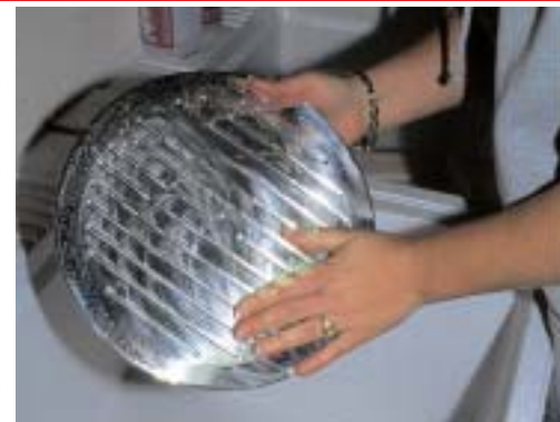
5) You want every impurity out of the pores of the metal because Zoopseal is going to fill those pores and maintain the exact appearance that you start out with on the part.