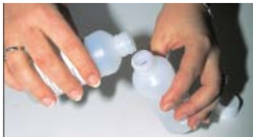
2) The core chemical in Zoopseal is a catalyst, which must be mixed before using. This is a ceramic-based sealer that impregnates the pores of the part. It is not simply a surface coat.