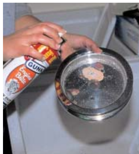
12) Most engine cleaners will not affect Zoopseal. Avoid alkaline-based cleaners such as turpentine or acetone.