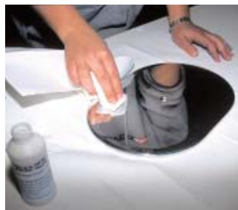
11) The final seal is like a wax. Apply it to the part and let it dry to a haze before polishing it off with a soft cloth. Let the part cure in a warm, dry place for 24 hours. Zoopseal offers UV protection and will not chip or peel.