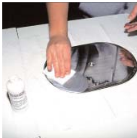
8) The sealer needs to be applied in a thin coat. Less is more here. The Zoopseal kit includes the lint-free towels to use for application.