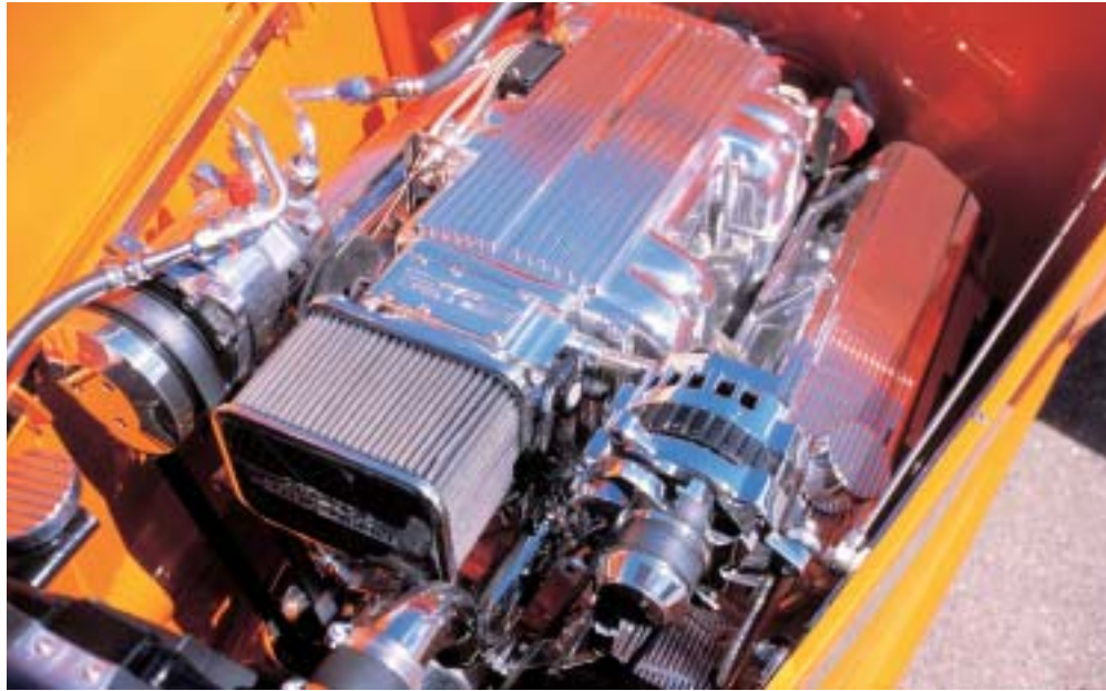
Everything in the engine compartment of the Zoops coupe has been coated with Zoopseal. They haven't polished anything in more than a year.

Nothing beats the look of polished billet parts—that is, if you like polished billet. And there's nothing as much of a pain in the #@* to maintain as polished billet parts. It's fun for a couple of times, and then the Zen-like wax-on/wax-off appeal fades pretty quickly, along with the luster of the polished parts themselves. What would you say if you didn't have to polish your shiny billet parts anymore? Well, we know what we would say!