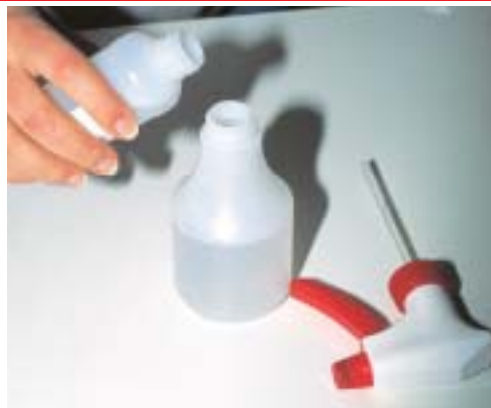
3) The kit includes deionized water for cleaning your parts. Zoopseal even comes with a spray bottle.