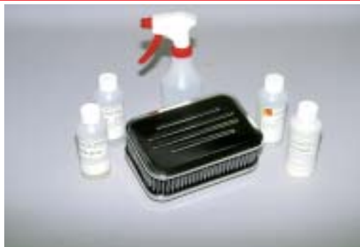
1) The Zoopseal kit comes with everything you need, including a special cleanser to get your parts extra clean. No, it doesn't come with an air cleaner cover!