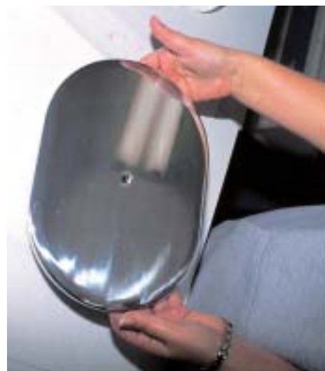
10) You can see a bit of a rainbow effect in this photo. Notice the streaks where the Zoopseal has been applied.